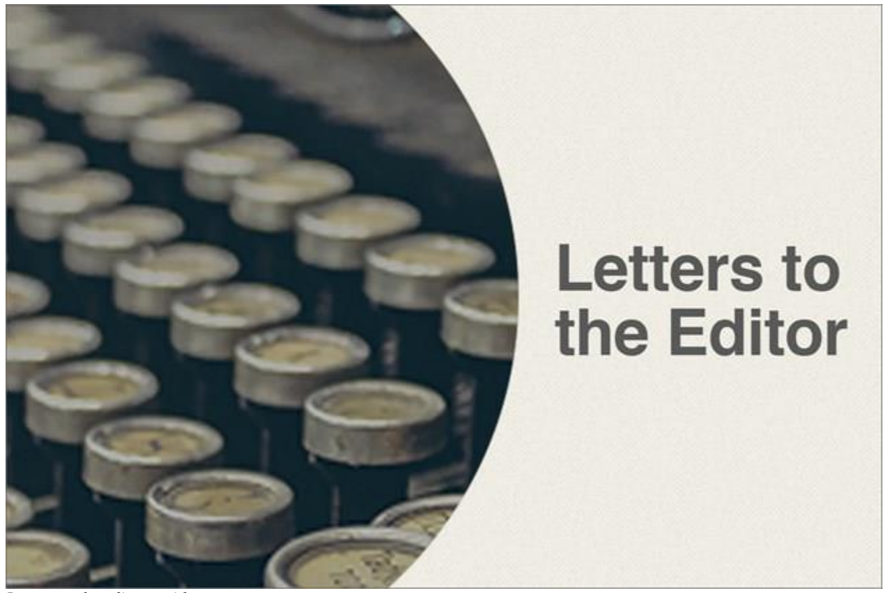
Letters to the editor - with text