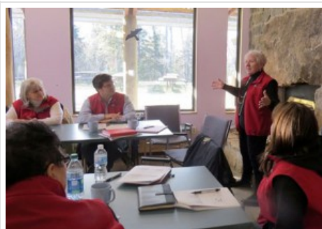
North Superior Workforce Planning Board Workshop

THUNDER BAY – BUSINESS - The Northern Policy Institute, in partnership with the North Superior Workforce Planning Board, have released a report on the labour market in Northwestern Ontario that details some of the unique characteristics of the region.