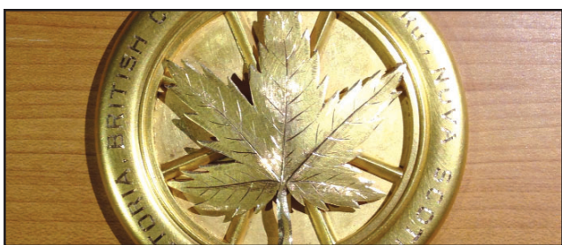
1st road trip across Canada Sunday Page/A5