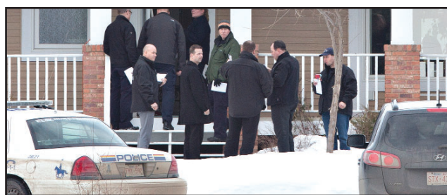
2 RCMP officers shot