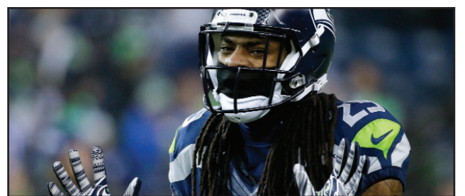
Canada/A7 Canada/A7 NFL title games on today Sports/B2-3